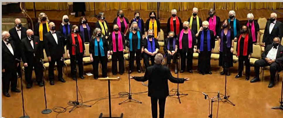
Mosaic Harmony Performing Members