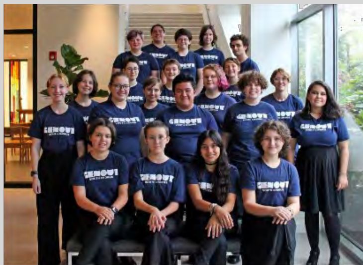
GenOUT Class of Fall 2022