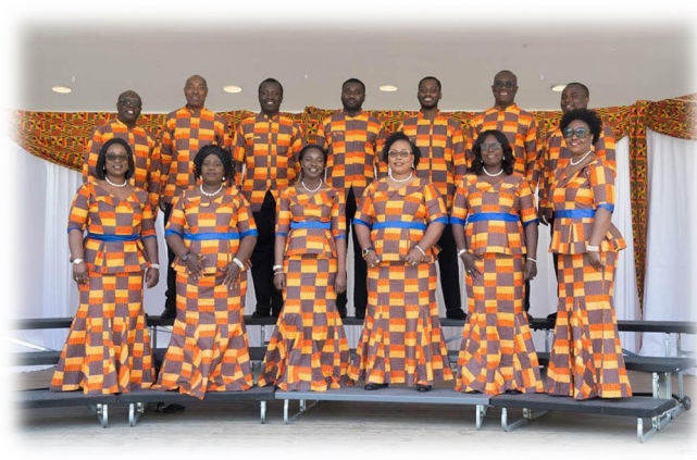
Tema Choir USA

Mosaic Harmony is honored to have partnerships with The GenOUT Youth Chorus and Tema Choir USA. We are enriched by our joint fellowship with each group, celebrating community and unity together. We look forward to future opportunities to perform together.