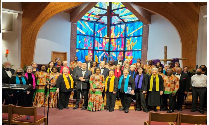
Mosaic Harmony & Tema USA Choir Performance - March 2023