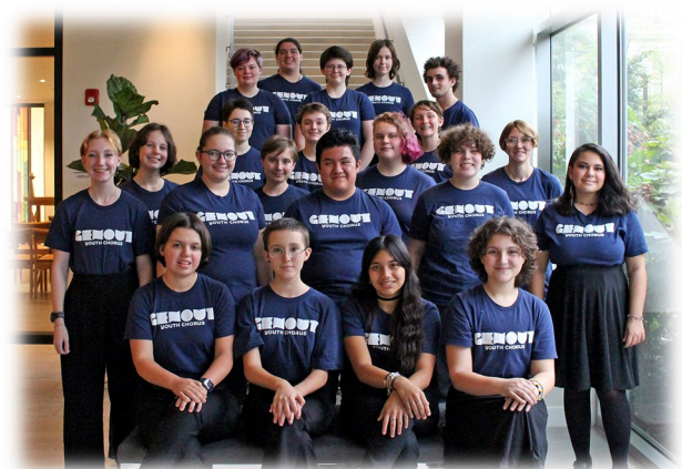
GenOUT Class of Fall 2022