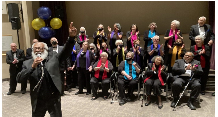
Washington Hospital Center Performance - February 2023