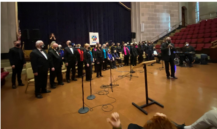
Mosaic Harmony & GenOUT Performance - October 2022